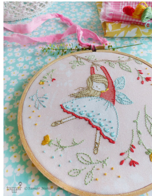
"Flying Fairy Girl"