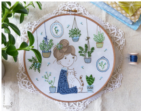
"Woman with Houseplants"