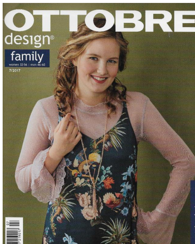
Ottobre Design Family issue #7/2017 back cover

Here is a video of what you'll find in this issue: