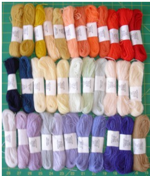
Typical Appleton Club monthly shipment

Hard to believe it has been more than 11 years since we started out Appleton Club back in August, 2006 with just 4 members. We had 11 by the end of the first year. A few opted to get all the 423 colors are once.