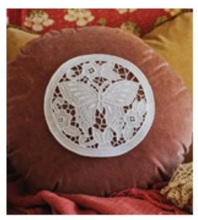
INS122-P8 Richelieu Butterfly