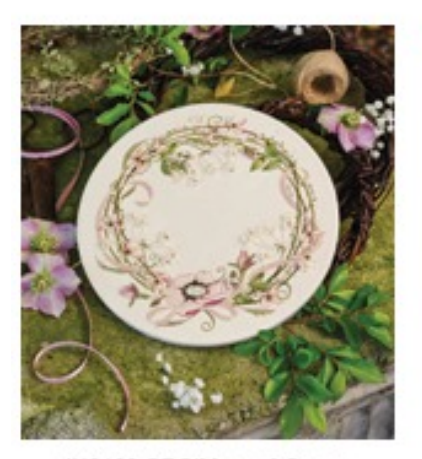
INS122-P7 Ribbons & Roses