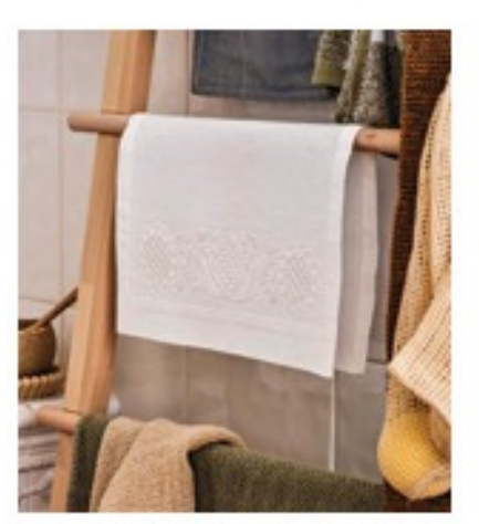
INS122-P3 Tulip & Sunflowers