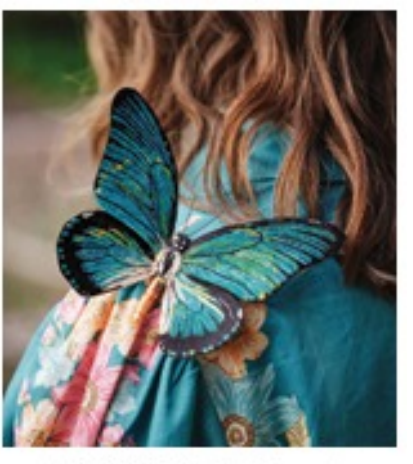
INS122-P2 Papilio Zalmoxis