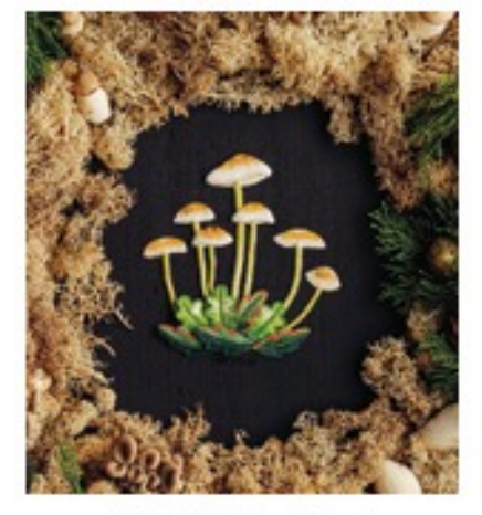
INS122-P1 Forest Fungi