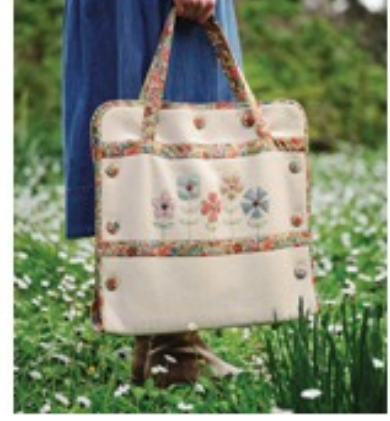
INS122-P6 Bon Voyage